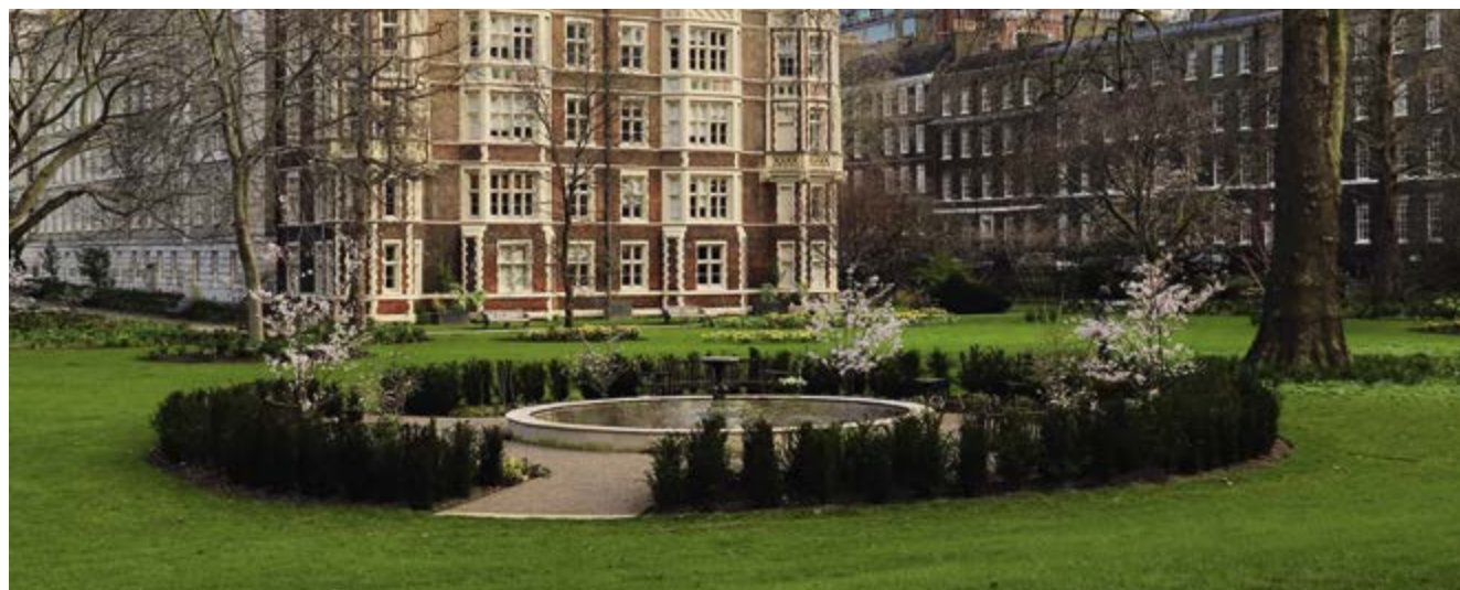
The Pond Garden in spring