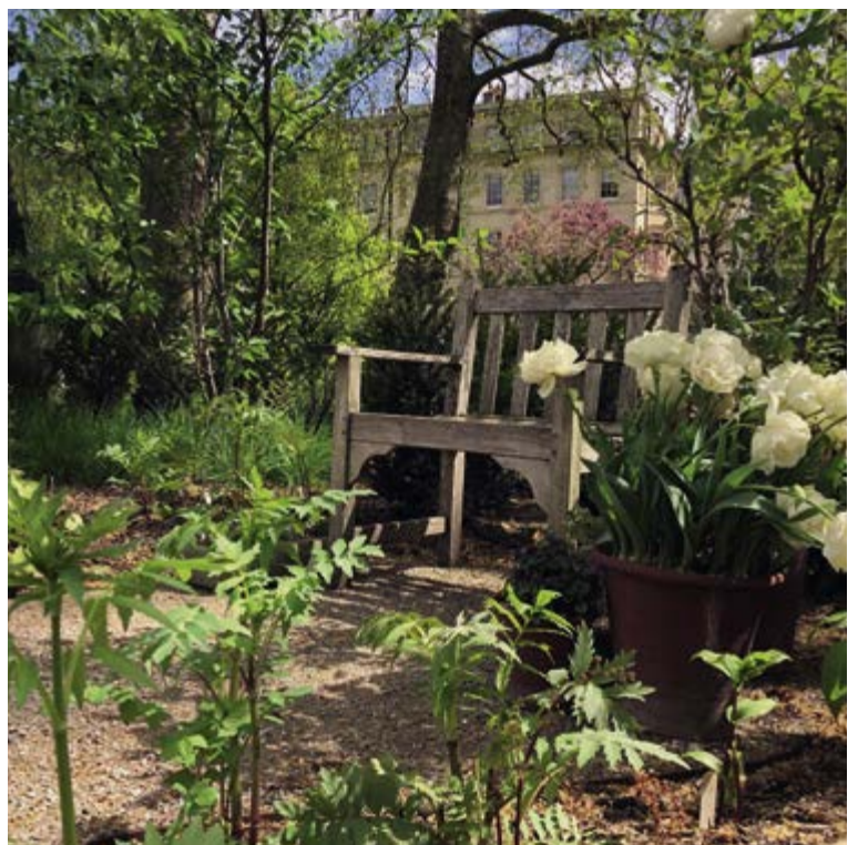
Armchair in the new Pond Garden