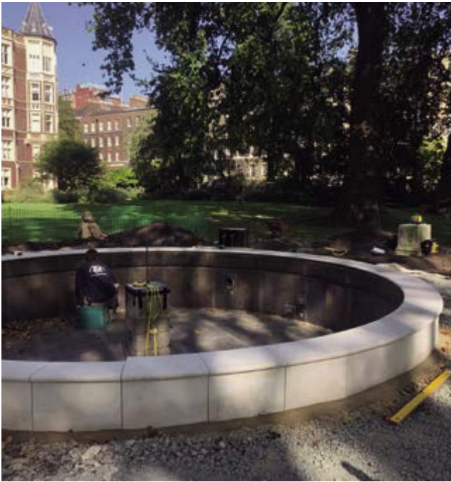
Pond construction, portland stone