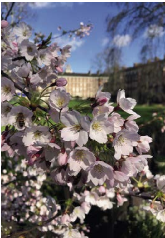
Blossom trees in spring: close up of Prunus x yeodensis