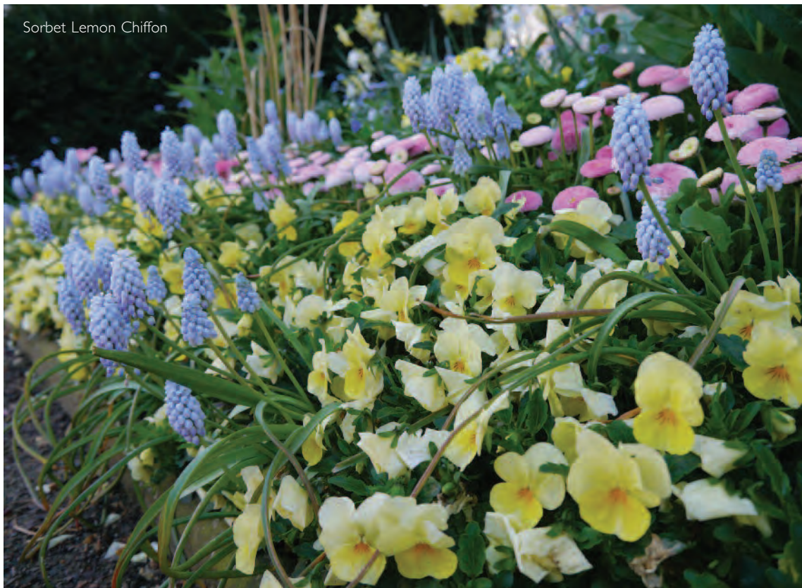
Sorbet Lemon Chiffon

T he Sub-Treasurer's Office has always been keen to develop and maintain the Inner Temple's connections with various overseas jurisdictions.