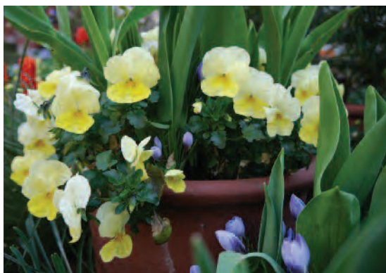
Above: Viola ‘Penny Blue Wing’, Below: Sorbet Lemon Chiffon’, Base of page left: Viola ‘Sorbet Yellow Frost’ and Base of page right: Viola ‘Supreme Ultima True Blue’

their rather delicate and humorous names, like ‘Lemon Blueberry Swirl’ or ‘Hollywood Honeys’, they are possessed of a seemingly relentless cheerfulness and endurance, even throughout the wettest British winter on record, for which I have grown to admire them.