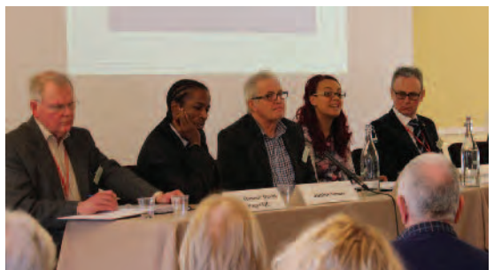
Speakers at Gang Crime Weekend