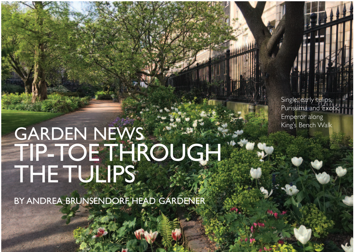
Single, early tulips, Purissima and 'Exotic Emperor' along King's Bench Walk