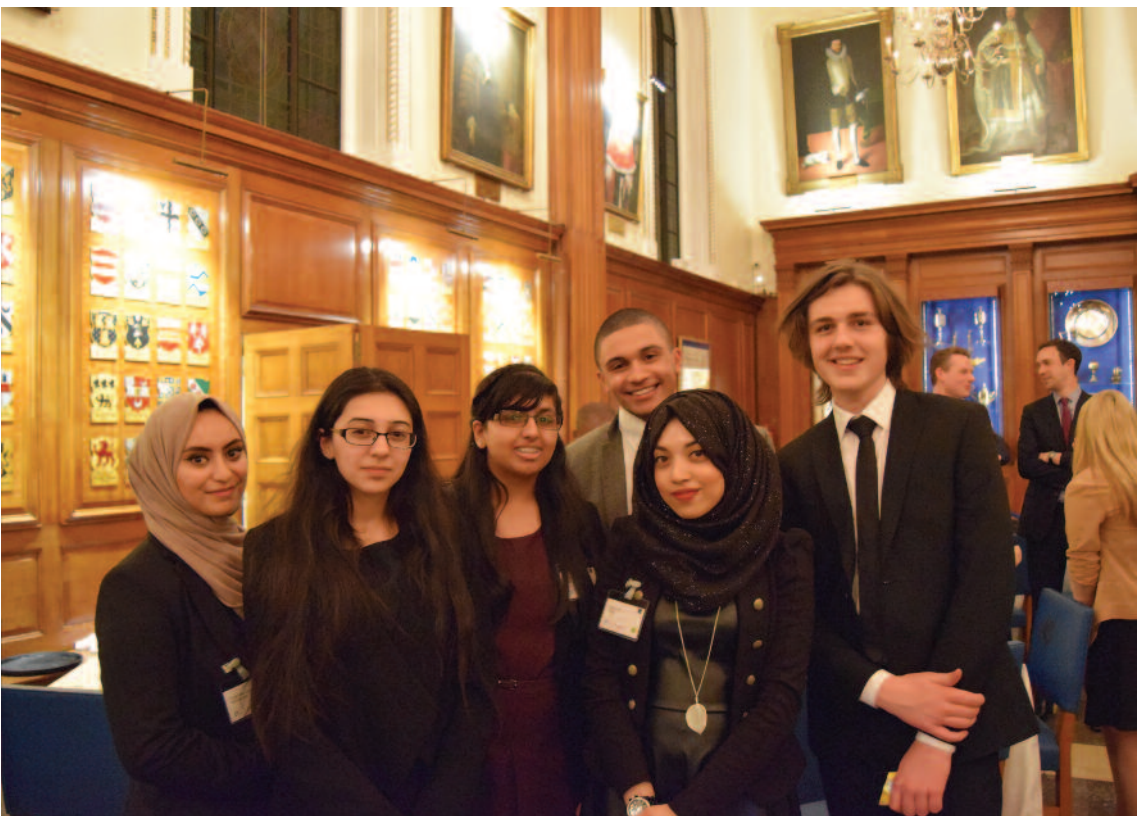
Pathways Plus students