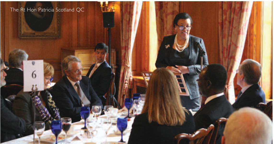
The Rt Hon Patricia Scotland QC

This was followed by a visit to the Inn by The Rt Hon Hugo Swire MP, Minister of State at the Foreign and Commonwealth Office, to review a number of Commonwealth initiatives which benefit from an input by the Inn.