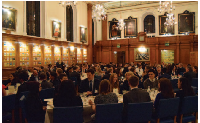
Pathways Plus dinner in Inner Temple Hall