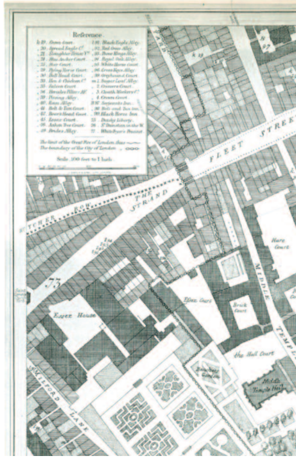
The Inn as it appeared in 1671 following the Great Fire of London

John Ogilby was also responsible for the production of two of the earliest known maps of the Inn, both showing the Inn after the Great Fire. He was employed by the Corporation of London as a ‘sworn viewer’ whose job entailed plotting out the disputed property in the City. His map of the Inn in