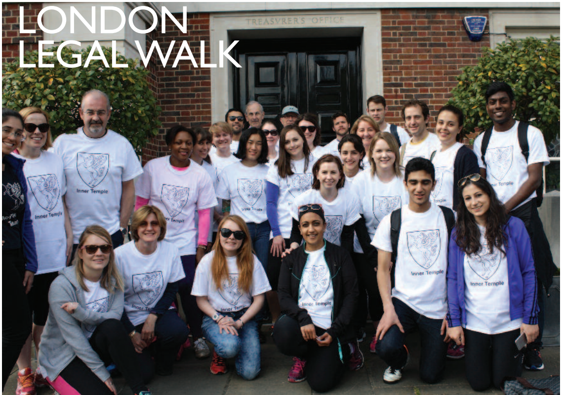
Inner Temple Team setting off on the London Legal Walk.

If you would still like to donate to raise funds for London Legal Support Agencies please visit our Virgin Giving page http://uk.virginmoneygiving.com/team/Inner_Temple