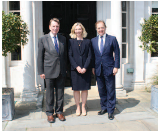
Right: The Rt Hon Hugo Swire MP