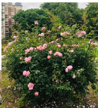
Rosa 'Scepter'd Isle' after meadow has been cut in August

For those that may be inspired to use this method, we begin as with all rose pruning by taking off any old leaves from the branches, so the stems are bare. We also