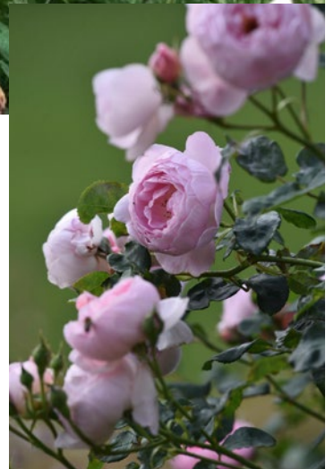
Close up of Rosa 'Scepter'd Isle'.

to Sissinghurst in the late 1930s. Here it became a key feature of the garden, though Vita Sackville West was not initially convinced by the trained forms until she saw the results in flower. Personally, I enjoy the architectural forms the trained 'baskets' create in winter. Gardens across the world have since followed suit, wanting to emulate