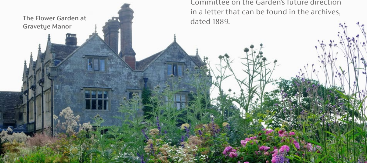
The Flower Garden at Gravetye Manor

The traineeship offers an opportunity like no other. Alongside the unrivalled training in high end ornamental horticulture within the team, the Garden's rich history and its standing in the horticultural world has also provided networking with other gardens. Through these connections I have spent time at Gravetye Manor, the historic home of William Robinson. Robinson was a leading pioneer in naturalistic gardening who advised the Inner Temple Garden Committee on the Garden's future direction in a letter that can be found in the archives, dated 1889.